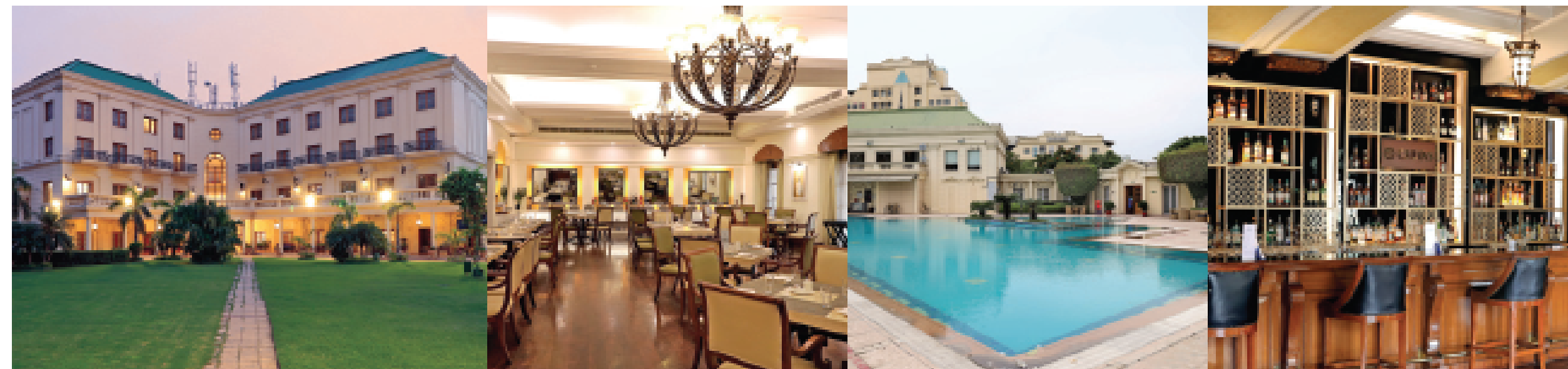
Actual images of DLF Club4

Take a leisurely dip in the swimming pool or challenge your friends to a game of tennis or burn some calories in the world-class gym. Relish various gourmet experiences with your family at the restaurant or celebrate with friends in the air-conditioned ballroom and party lawns. For those who seek the privacy of independent floor living, DLF Club4 offers the perfect balance with access to the benefits of community living close to home.